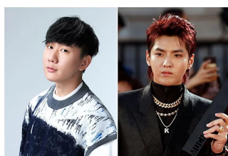
Singer JJ Lin